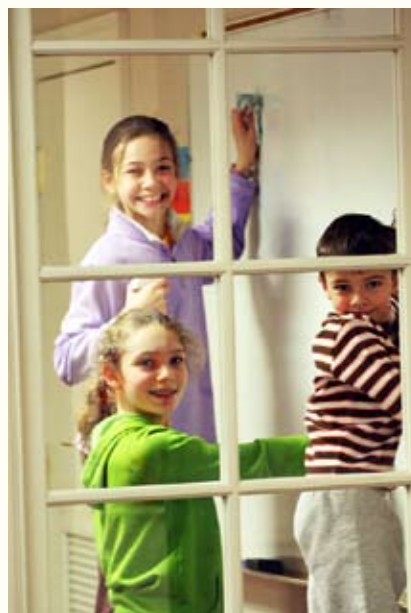
Christ Church youth help keep Fowler House clean and ready for ministry.