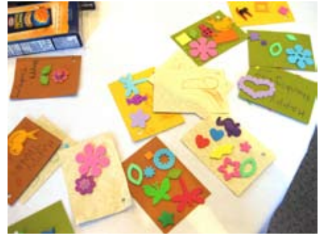
Samples of cards created by our Sunday school kindergarten class for Thanksgiving 2009.

Please join us for this special occasion.